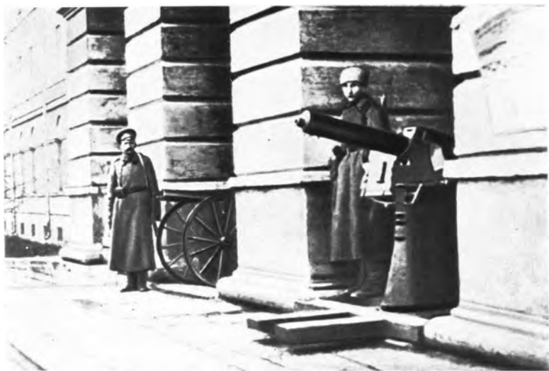
Entrance to Smolny, guarded by soldiers and Red Guards