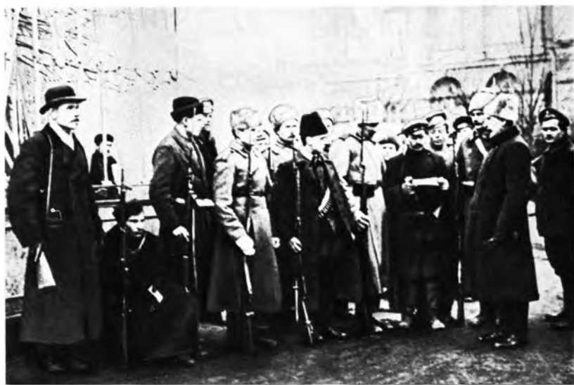
Red Guards checking passes at Smolny