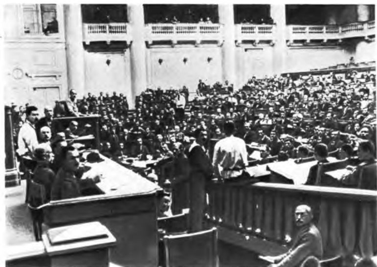
Petrograd Conference of Factory-Shop Committees, June 12-June 16, 1917