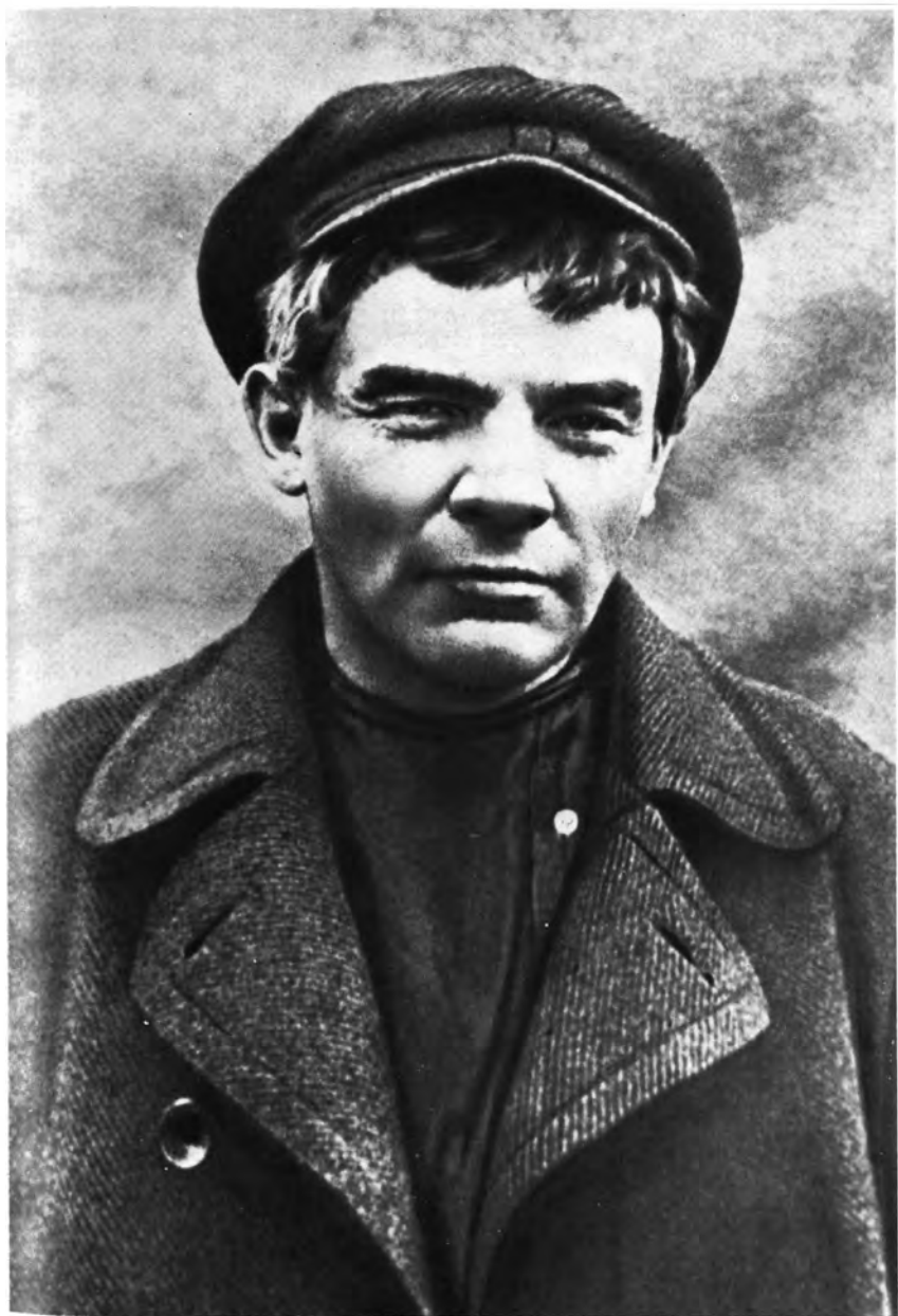
Photograph of Lenin in disguise on the identity card issued in the name of K. P. Ivanov, a worker, used by Lenin during his last period underground after the events of July 1917