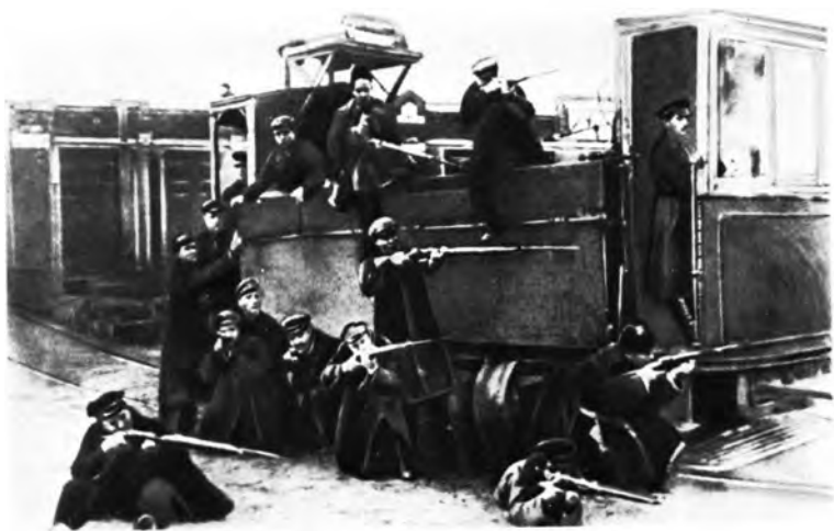
A reinforced tram platform used in the November fighting in Moscow's Zamoskvorechye District