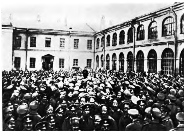
A meeting of soldiers in the Grenadiers' Barracks in October 1917. The speaker is a Baltic Fleet sailor