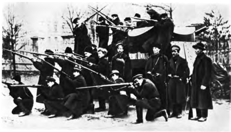
Red Guards from Putilov Works on the armoured car named after Lieutenant Schmidt, October 1917