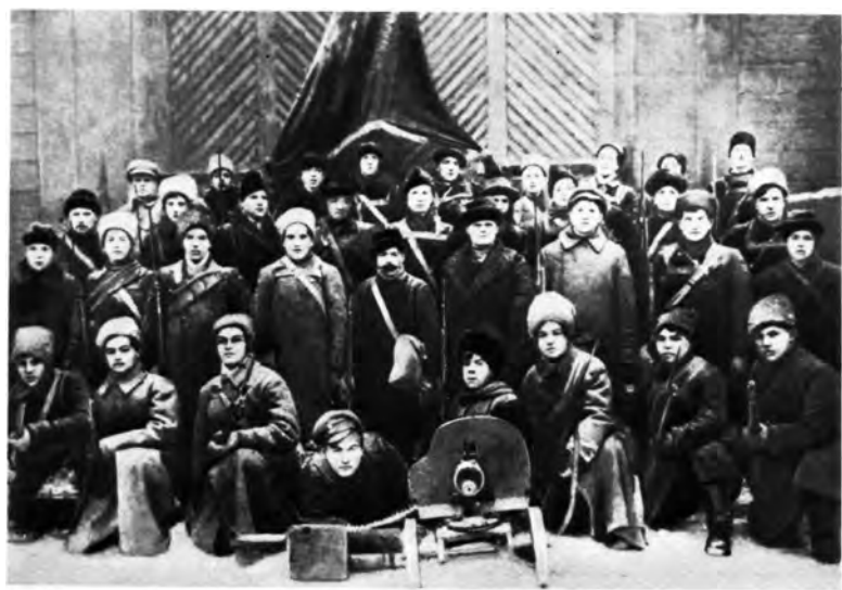
Red Guards of the Novy Lessner Factory, Viborg District, Petrograd