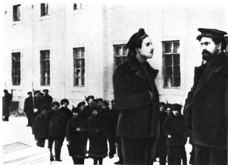
A detachment of sailors commanded by Dybenko on its way to fight Kerensky's troops